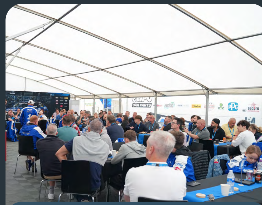
WATCH TRACKSIDE FROM OUR VIP HOSPITALITY