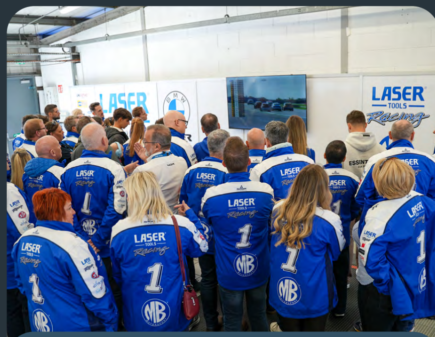
TAKE IN THE RACING ACTION FROM THE GARAGE