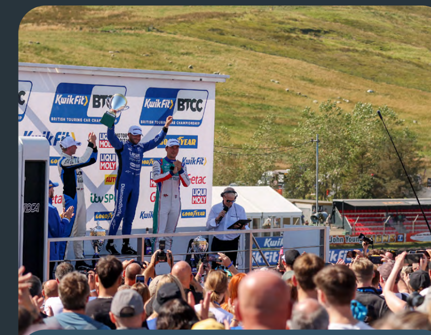
JOIN THE PODIUM CELEBRATIONS