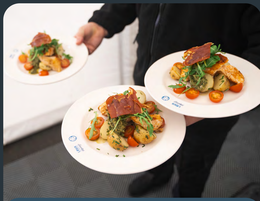
FOOD & DRINK Breakfast, Lunch and Afternoon Tea