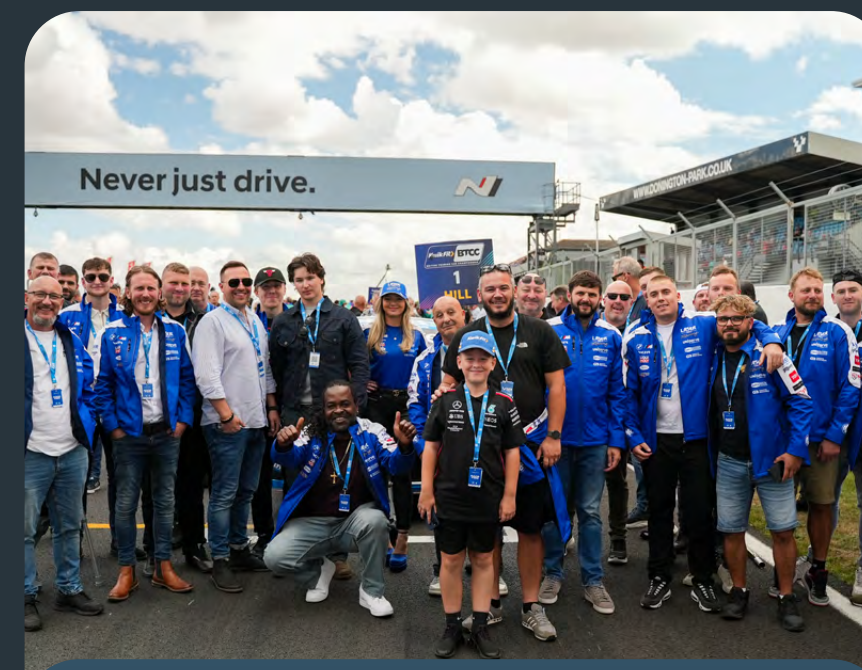
GET ON THE GRID WITH EXCLUSIVE GRID WALKS!