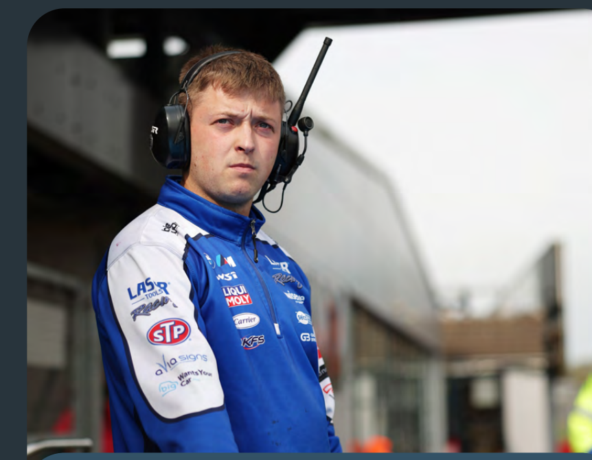
EXCLUSIVE TEAM MERCHANDISE