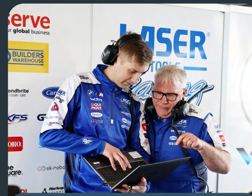
MEET THE TEAM